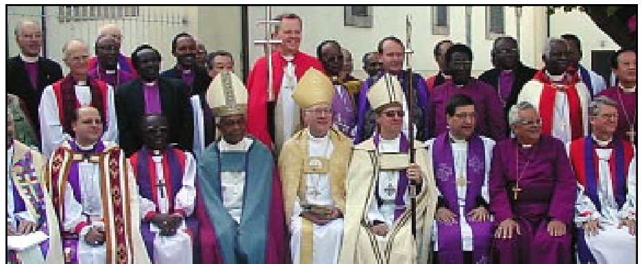
The Primates of the Anglican Communion – at their meeting in Portugal last year.

Please pray for godly wisdom for the Primates as they meet early this month.