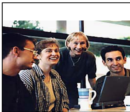
Moore College students.

History helps us understand who we are and where we are going. The developments I have outlined represent the gospel and the Bible in action. For example, study them and you will see that they have been shaped by the type of men and women who have been involved in our church.