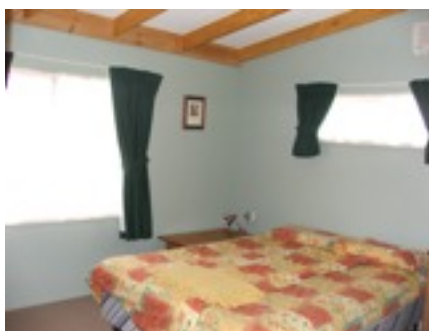
One of the bedrooms